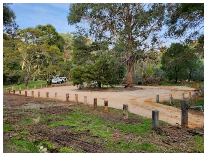
Pictured above: Improved Tipperary Springs car park