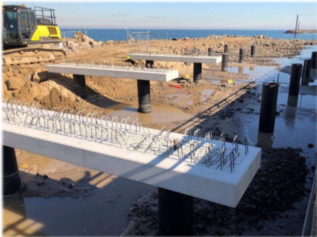
Figure 2 Pre-cast concrete headstocks are being installed along the alignment of the new pier

As shown in the image below, pre-cast concrete headstocks have started to be installed on the steel piles. These will form the foundation of the pier structure which will feature a combination of concrete and hardwood timber decking.