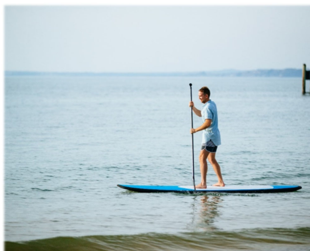
Figure 5 Please be aware of boating zones and exclusion zones this summer