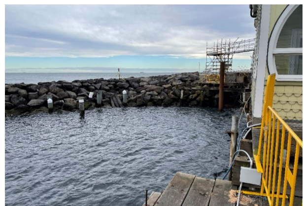
Figure 1 Decking next to the kiosk has been removed

allows Parks Victoria staff and a dedicated team of volunteers from Earth Care St Kilda to continue penguin monitoring.