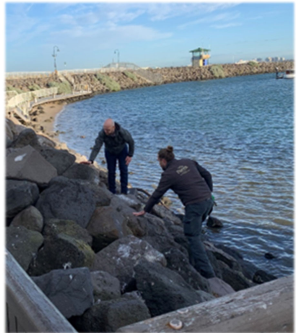
Figure 4 - park rangers and volunteer experts from EarthCare St Kilda are continuing to access the breakwater to monitor the penguins

Protected as part of a Wildlife Management Cooperative Area, St Kilda Pier's breakwater is home to a colony of approximately 1,300 Little Penguins. Given its ease of access to people living or holidaying in Melbourne, over the past ten years, we've observed an extraordinary increase in visitor numbers to view the penguins. This is despite no active promotion or provision of dedicated facilities. The pier redevelopment has given us the opportunity to improve environmental protection and enhance visitor experience. Visit the project website to learn more.