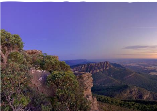
Grampians (Gariwerd) National Park.

Before proceeding to the application stage, use the following checklist to ensure you have all the required information. As part of the application process, you will be asked for all the following information.