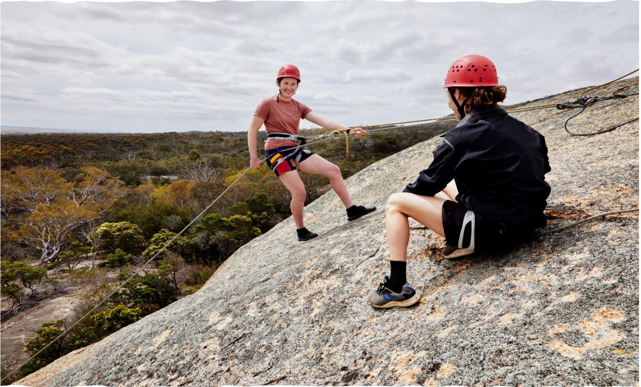
You Yangs Regional Park.