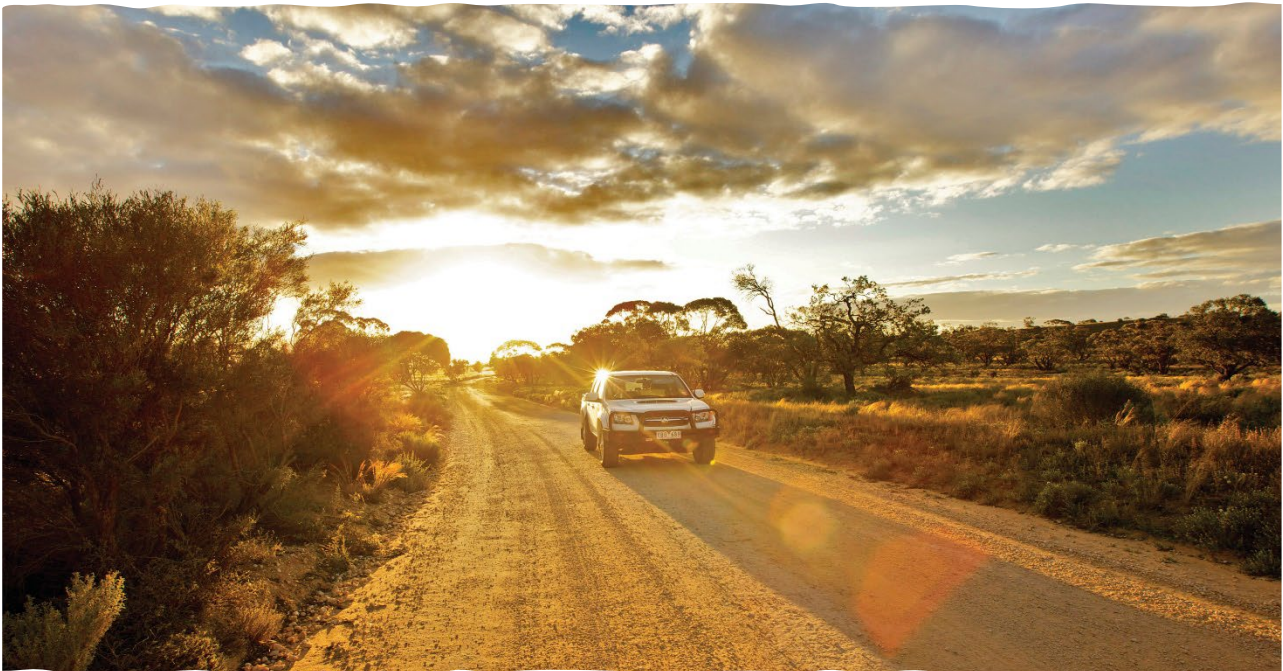
Murray Sunset National Park

Tour Operator and Activity Provider legislation, regulation and policy has been developed and is maintained by the Department of Energy, Environment and Climate Action (DEECA). You can find additional licensing details such as Policy Statements and Fact Sheets by visiting forestsandreserves.vic.gov.au/tour-operators .