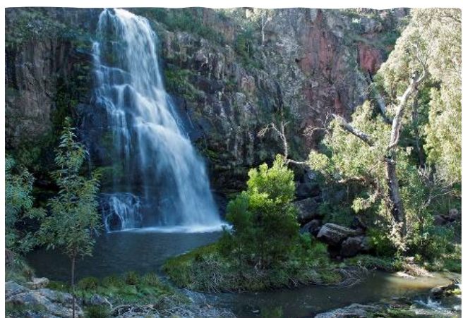
Snowy River National Park.